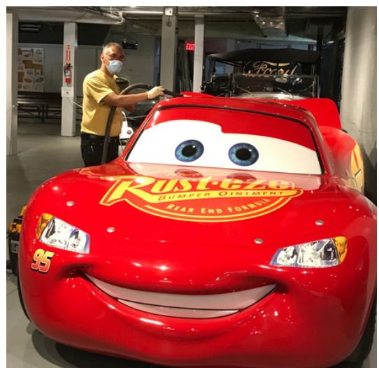
Ian cleans Lightning McQueen.

The museum is fortunate to have a wonderful group of over 20 dedicated volunteers helping throughout the year. Our volunteers assist with special events and tours, cleaning the museum, photographing the collection, and even moving cars around the galleries. Thank you to our friends all over the world who helped with research requests in 2020!