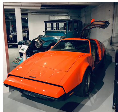
Our 1975 Bricklin SV-1 on display